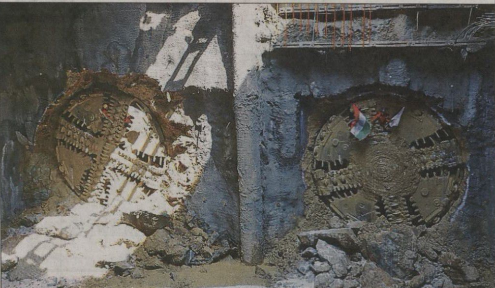
NAYANAGAR-DADAR TUNNEL READY: Krishna 1, lowered on Sept 21 2017, completed 2490 metres of tunnelling on Thursday while Krishna 2, lowered on Oct 18 2017, completed 2472 metres to emerge at Dadar station site