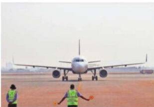
First commercial aircraft landing on the runway of Navi Mumbai International Airport, Narendra Vaskar

ground metro will be fully operational in 2025. The 33.5-km Metro 3 line, which connects Colaba to SEEPZ via Bandra, looks to revolutionise public transport in the city. While some sections opened in 2024, the entire line is set to be completed by the end of 2025, easing the pressure on Mumbai's overcrowded local trains and providing a faster, air-conditioned alternative. The metro's completion will drastically cut down travel times and boost overall connectivity across key areas of the city.