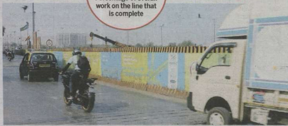
Barricades installed on the road for Metro Line 3 near BKC

'Road restoration work is on at MIDC, Marol Naka, Seepz, Vidyanaagri, and Dharavi stations of Metro Line 3' An MMRCL official