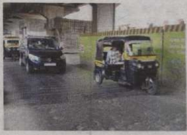
Temporary barricades installed on roads for Metro Line 3 work

ready by April 2023 and the depot will be able to handle operations for the Phase-I corridor in July 2023. Some other works may continue such as the Operation Control Centre (OCC) at the Aarey depot site. However, this will not be a hurdle as there is a provision to have a Backup Control Centre (BCC) at BKC Metro station.