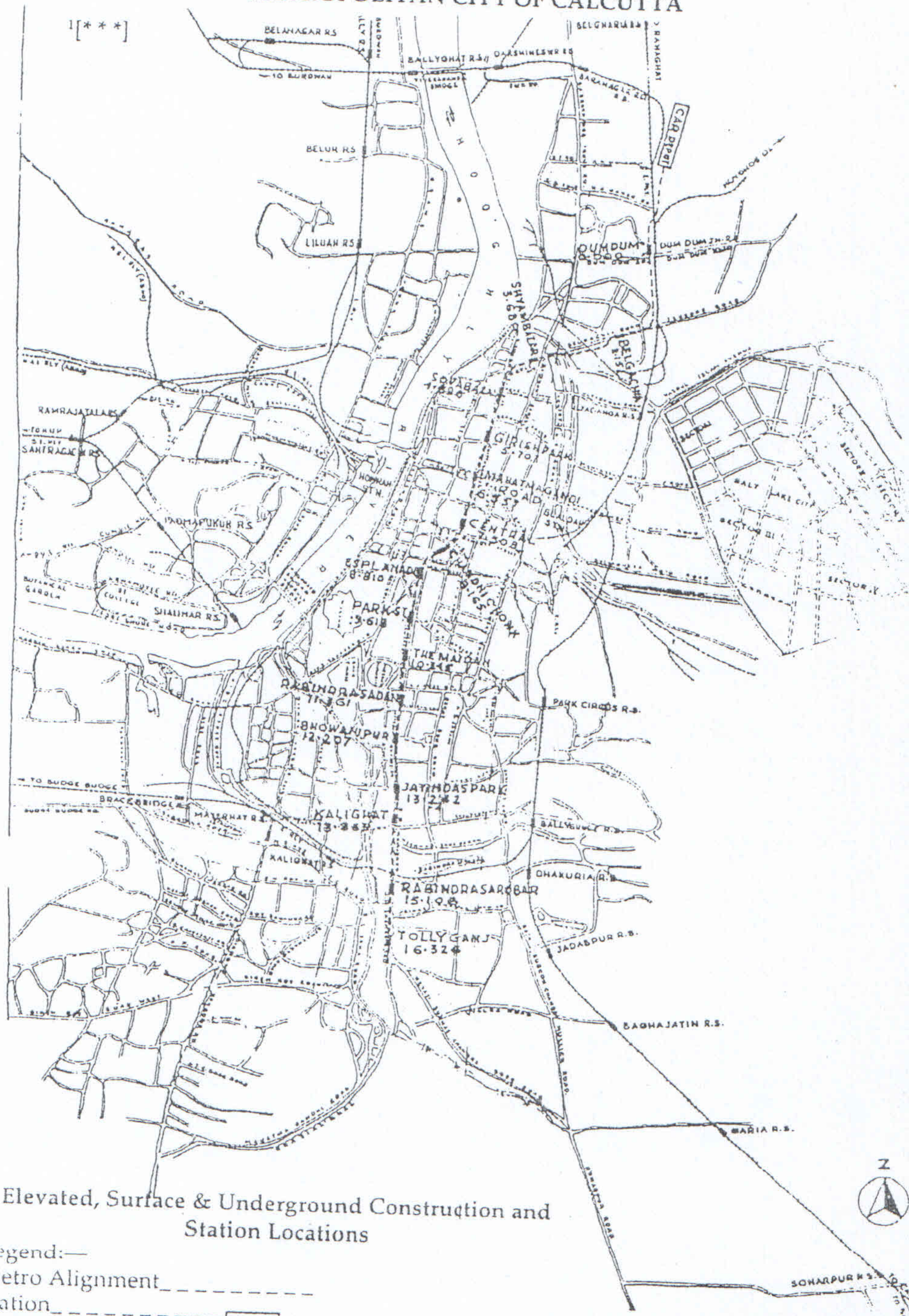
Elevated, Surface & Underground Construction and Station Locations

Legend:— Metro Alignment ——— Station ——— Distances in K.M. ———