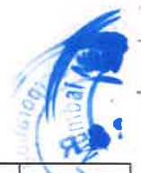
TABLE A3 : Socio economic profile of PAPs (for individuals)